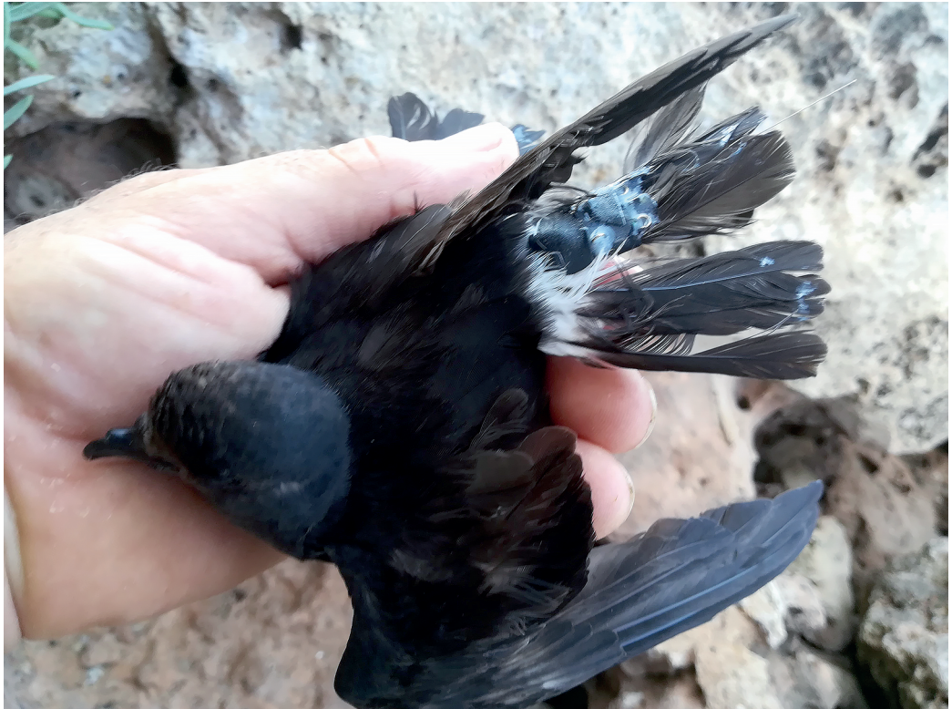
Figure 1. Small GPS device fitted on the central rectrices tail feathers. Petit GPS col·locat a les plomes rectrius centrals de la cua.

Every year, we captured birds at nests using mist-nets but without playing tapes. During the 2019 breeding season we captured birds in 11 different sessions but in 2020, 2021 and 2022 we only captured birds during two consecutive sessions each year. Mist-nets were used in the two largest breeding areas, La Cova (only in