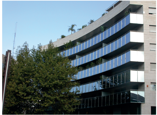
Figure 1. The studied building in Plaça Imperial Tarraco, Tarragona. L'edifici estudiat a la Plaça Imperial Tarraco, Tarragona.

In 2012, the occurrence of bird fatalities centred on a building in the centre of the city of Tarragona (NE Spain) was detected fortuitously (Imma Martínez, pers. comm.). Subsequently, we were informed of a complaint that local people had made in 2008 regarding the number of dead birds. Thus, there was evidence to suggest that this site was a blackspot for bird mortality, presumably ever since it was built in 2000. To quantify the number of species involved and the phenology of bird casualties on this building, we carried out surveys during the postnuptial migration period in 2012–2015. As well, we compared the sample of dead birds with those trapped in a nearby ringing